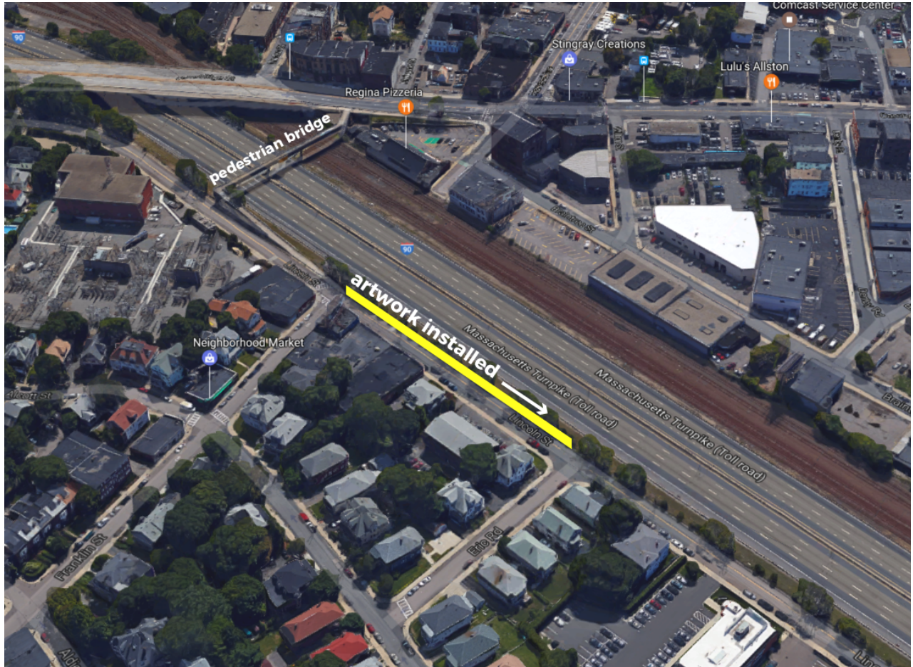
Above: Bird's eye view looking South from North Allston. Below: Street view looking East toward pedestrian bridge with site for artwork highlighted in yellow.